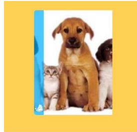
How to Get a New Pet